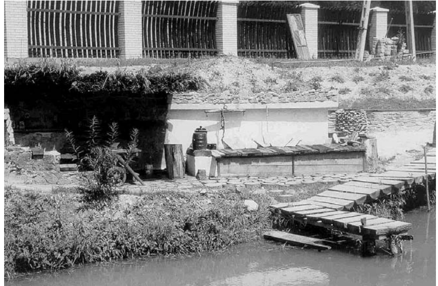
Brightsite in Megawita

A very original and visually attractive project of aesthetic improvement of the company's grounds. The author of the idea, design and implementation was the owner of the company. The grounds around the company are open not only to all the employees but also to the local community and a nearby school. The company also initiated the action of cleaning the banks of a nearby river, engaging local schools and residents (organized under the Clean the World action).