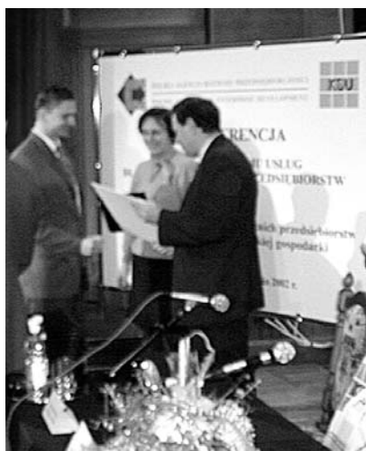
→ Representative of Clean Business receives the certificate of the National Services System (KSU)

cohesion funds to support further development and scaling up of Clean Business.