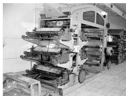
„ELPLAST” Plastic Production Line

Production cost of the new plastic is much lower than in the case of standard multilayer plastics because of lower cost raw materials and lower energy consumption (up to 40% less energy).