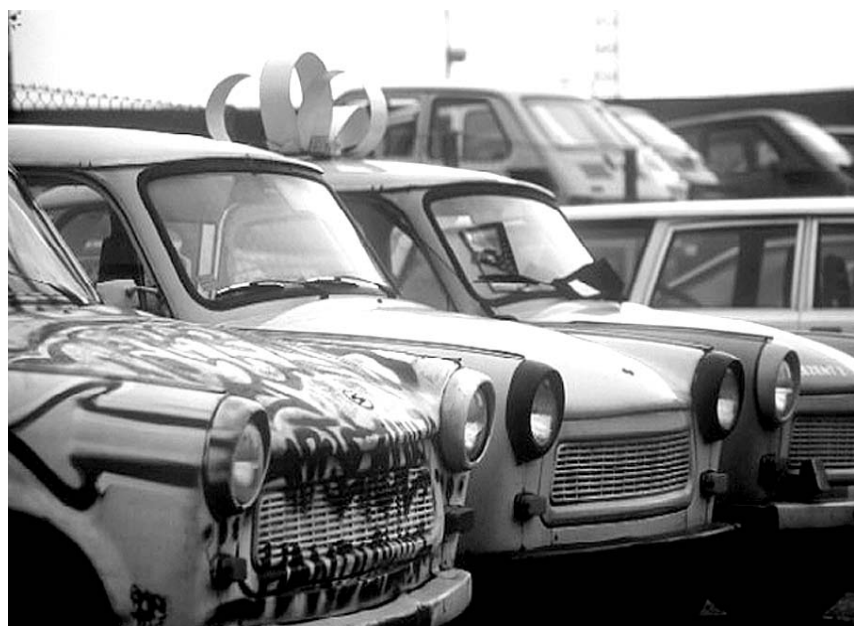
“Brightsite” project in Maxi Schrott company in Kraków-Nowa Huta

Maxi Schrott is a scrap yard located in the industrial part of Nowa Huta, which specializes in recycling motor vehicles and selling parts and accessories. The company operates a compactor for vehicle bodies, drying facilities, and a system for disassembly and segregation of reusable parts and wastes. The processing facility is isolated from the surrounding industrial area with full environmental safeguards and provides for a safe and friendly workplace. The company has not only cleaned up its own site of operations, but also improved derelict surrounding areas, which had been long neglected. These activities have included laying tarmac on access roads and parking areas, fencing, pavements for pedestrians, establishing green corridors with grass, flowers and bushes to improve visuals, as well as signage.