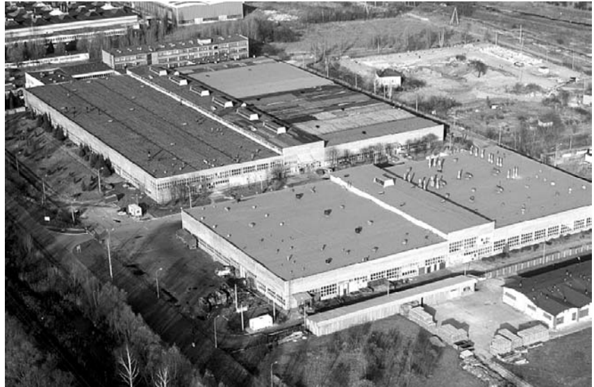
Marbet Will Ltd. – offers technical solutions for neutralizing and re-using toxic and hazardous industrial solid wastes restoring slag wastes from steel production

Research on production of sulphur-based binding agents was initiated at Marbet in early 1998. The company was the first in Europe to patent and initiate production of the polymer SULWIL® made from materials based on waste sulphur from natural gas desulphurization installations. In 2000, promising test results of quality of the sulphur polymer prompted a search for industrial applications. The company now offers technical solutions for neutralizing and re-using toxic and hazardous industrial solid wastes using solidification methods with sulphur polymer SULWIL® and concrete polymer SULTECH®. The process transforms wastes into a solid form, which is physically and chemically inactive with minimal environmental impact. The mechanical and physical-chemical characteristics of the solidified material mean that it can be used in road and other construction.