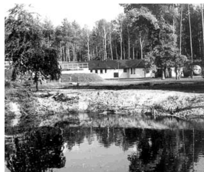
Effluent treatment plant in Nowa Dęba

using Company from Nowa Dęba - the area around the plant has been developed into a kind of small zoo with little fish ponds, apiary, African ostrich breeding farm, tortoises and a shelter for homeless animals. The area is open to the local community and frequently visited by schools.