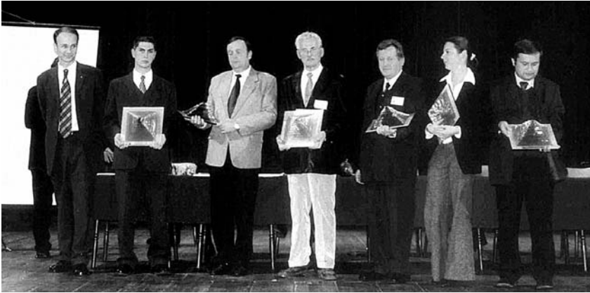
Clean Business Award winners – Bielsko-Biala 2002

work with companies and prospective investors to improve the attractiveness of industrial areas as a way of stimulating economic, environmental and social revitalization.