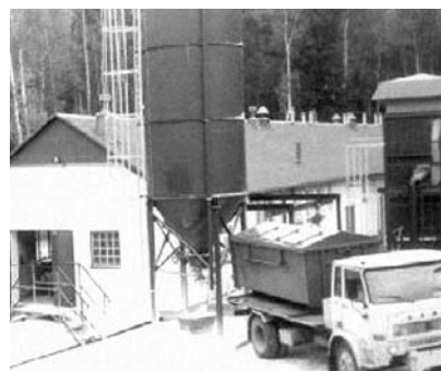
Municipal and Housing Company in Nowa Dęba – reducing costs of heat production for the town

In 2002-3, a new biomass municipal boiler house was built, along with an installation for biomass fuel preparation. Heating pipelines were modernised and insulated. The willow plantation of the Municipal and Housing Company currently covers approximately 83 ha. Approx. 400 ha is needed to cover fuel demand of the new boiler and so the company encourages local farmers to start willow cultivation by organising training and supply of willow plantings.