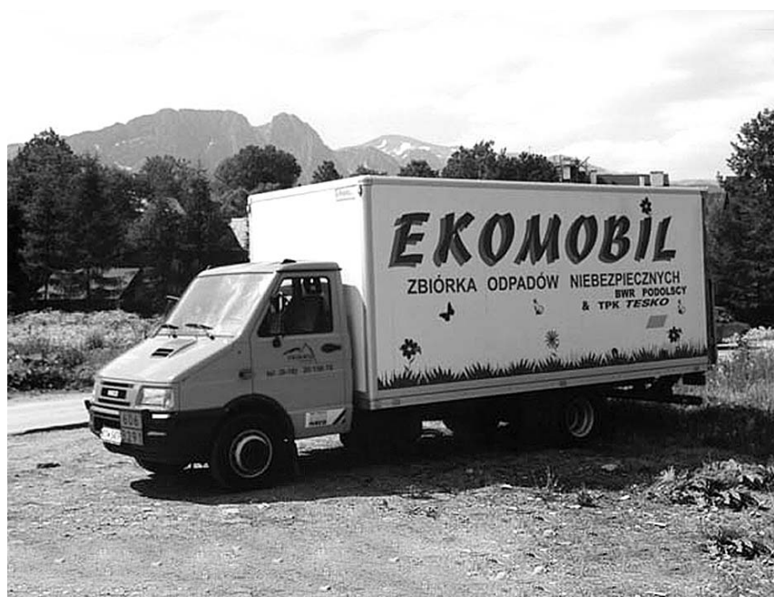
Hazardous wastes are transported by a special vehicle – Ekomobil

TESKO has introduced a system of hazardous waste collection in the Tatra and the Nowy Targ Poviats with the objective of separating hazardous waste from the municipal waste stream. This involves special collection points for household hazardous wastes and on-site collection of hazardous wastes from businesses, health centres and other waste generators. Collection activities are organized by specially trained staff and are integrated into the company’s environmental management system. Specialized temporary storage facilities have been established, including a cold room for medical waste and secure space for toxic wastes. Wastes are transported by a special vehicle purchased with funds from the Danish Environmental Protection Agency (DEPA). The hazardous wastes collected are transferred for disposal to specialized companies. Thanks to TESKO, Zakopane is Poland’s first city to have an integrated system of hazardous waste collection.