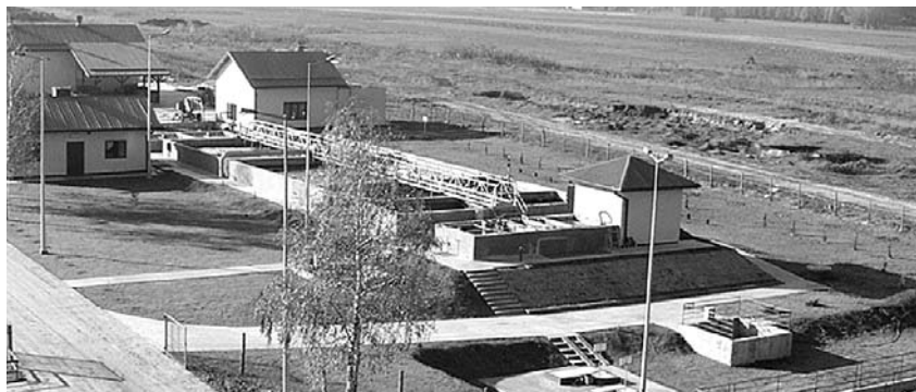
Effluent treatment plant in the Meat Processing „Dobrowolscy” Ltd.

The company built on its premises a modern effluent treatment plant, which considerably reduced the company's impact on environment. Running the treatment plant is much cheaper and more cost effective than disposing of the company's effluent to the Tarnów treatment plant (very high cost of transport on the company's side). The cost of building the treatment plant will pay back after two years. The sludge from the treatment processes is used as a fertilizer (the company is located in a primarily agricultural area).