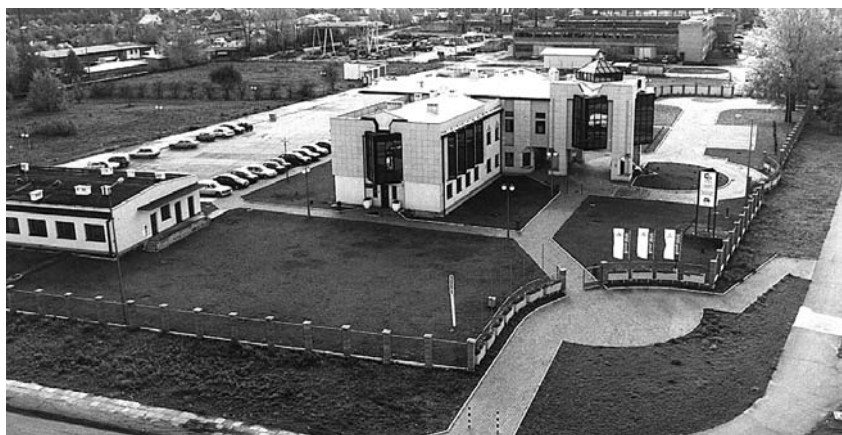
Environmental landscaping in Mielec

The Agency is concerned with assisting in the restructuring of state owned industry and promoting new initiatives in line with market reforms. Over a period of five years, the Agency successfully modernized old infrastructure, provided new facilities for investors, revitalized neglected green areas and built a modern building on a derelict post industrial site in Mielec. In revitalizing the 627 hectare site, the Agency established a landscaping and environmental management programme to increase attractiveness and prestige of the site.