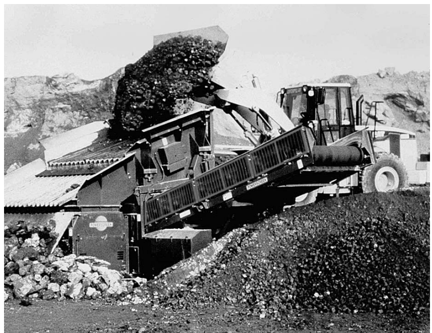
Slag Recycling Ltd. – restoring degraded industrial areas in Nowa Huta

In its business activities, Slag Recycling has emphasized the need for promoting research on the existing and potential uses of slag wastes from steel production. The company has financed several research projects on the application of slag wastes in road construction, on their environmental impacts and on possible new applications. Independent assessment and monitoring has confirmed that slag wastes materials used for road construction provide an excellent alternative to conventional mined materials and meet all environmental safety standards. The high quality of Slag Recycling products has been recognized by awards and prizes at specialized trade fairs. The company is also active in supporting a wide range of philanthropic causes and has been active in helping schools, childrens' homes, local governments and individuals affected by flood damage, especially in the towns of Raciechowice and Żegocina. Financial and in-kind support (building materials) have been provided to the Monar drug therapy centre and to cultural institutions.