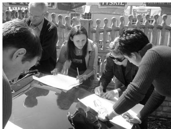
← Clean Business staff training