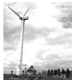
← Wind turbine in Zawoja Przyslop

the environment. Energy audits have been completed in monastery buildings as part of the process of replacing coal boilers with more environmentally friendly heating systems. Many of the solutions developed in the Monastery are being replicated in the surrounding village by local people thanks to the Zawoja Sustainable Development Association.