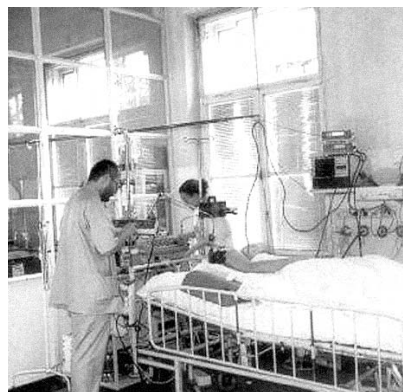
← St. John's Hospital in Krakow – the first hospital in Poland to gain ISO 9001 and ISO14001 certification