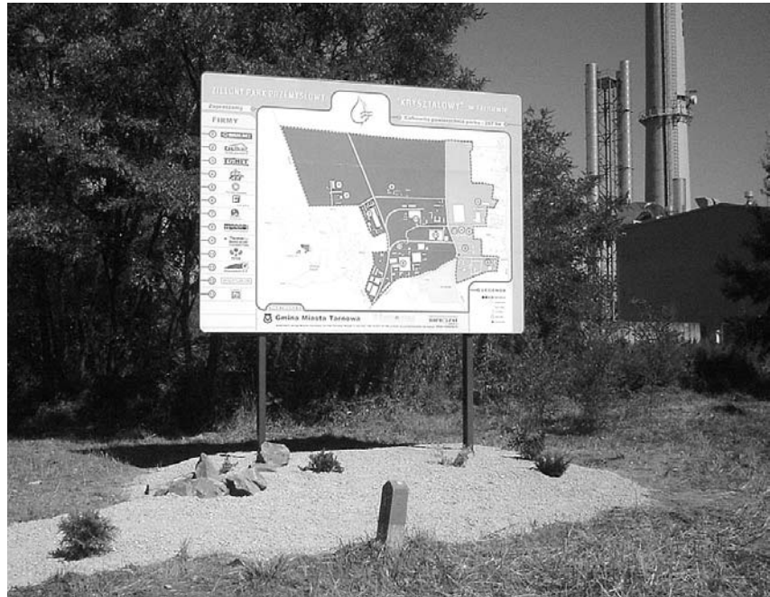
Signage in the Crystal Green Business Park

The project is a long term one and one of Poland’s first public-private partnerships aimed at making the industrial area attractive to existing companies, as well as to inward investors. The borders of the Park have been delineated and the City is offering land tax relief to potential investors. Local companies and community groups are being consulted in the design and planning process of establishing the Green Industrial Park to create also a climate of public support.